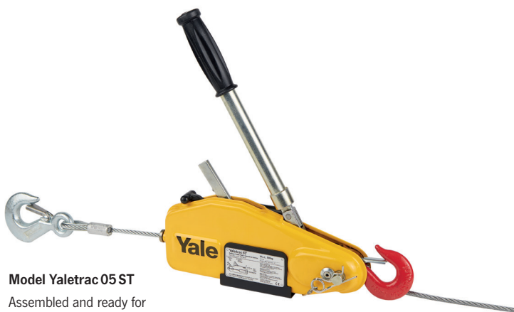
Model Yaletrac 05 ST Assembled and ready for operation (installed)