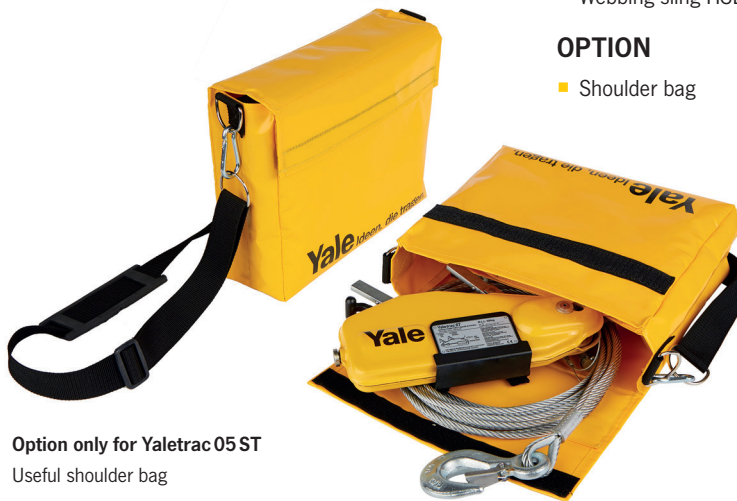
Option only for Yaletrac 05 ST Useful shoulder bag